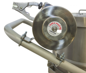
Grounding reel with stainless steel housing and cable - Optional