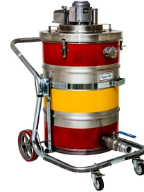
EXP1-55 (TC) TE