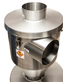
#112304-8 - HEC-200L (4W) STAINLESS STEEL w/8" Inlet and Outlet