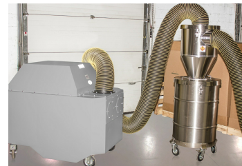
HEC-200 (4W) STAINLESS STEEL w/8" Inlet and Outlet in conjunction with CD-1200 EX Portable Dust Collector