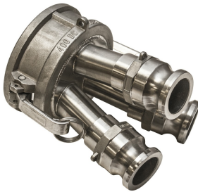
#990062 - Stainless Steel 4-Way Connector, 4" Female Camlock with 3 x 1.5" Male Camlocks - Optional