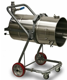
Tilting Cart Assembly