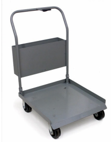
HCS-114L EX Open-Front Drum Dolly - Included