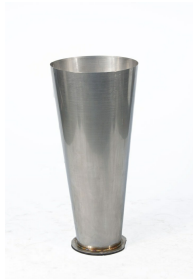
HCS-114L EX Cyclonic Cone - Installed