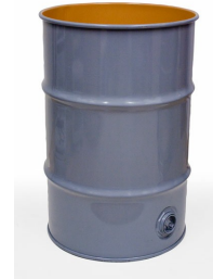
HCS-114L EX Recovery Drum - Included