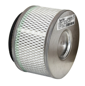
HEPA Filter - Included