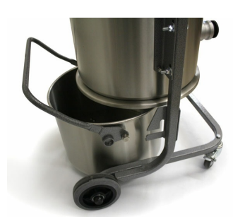
25L Detachable Tank

Website: http://www.tiger-vac.eu Email: info@tiger-vac.it