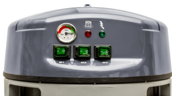
Independent Control for each motor. Pressure Gage and Filter Blockage Indicator