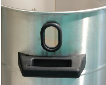
Sight Glass on Recovery Tank