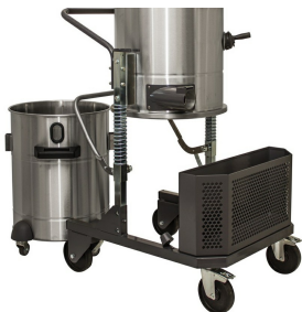
Detachable Recovery Tank for easy emptying