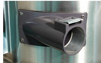
Tangential Suction Inlet, 70 mm, Aluminum