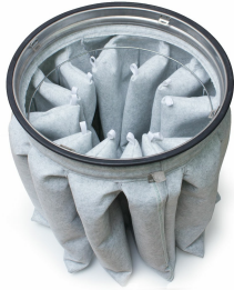
Conductive Star Shaped Filter with Cage - Included