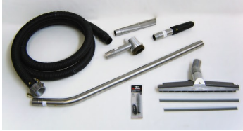
Ø2" (Ø50 mm) Static Dissipative Tools and Accessories - Included