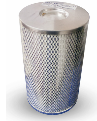
HEPA Filter - Downstream - Optional