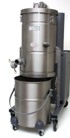
CD-100L (DT) EX (MFS) with Recovery Tank removed