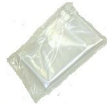
Clear Polyliner Recovery Bags - Included