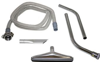
Ø1.5" (Ø38 mm) Tools and Accessories - Included