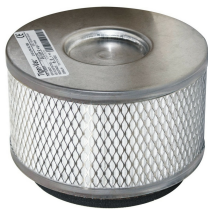
HEPA Filter - Included