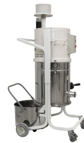
TV-25L (DT) MFS with Recovery Tank removed