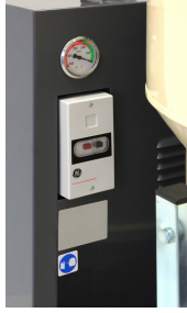
Filter Blockage Indicator Gage. Manual Starter with Overload Protection