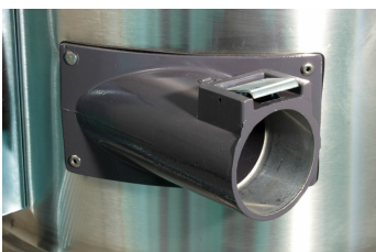
Tangential Suction Inlet, 70 mm, Aluminum