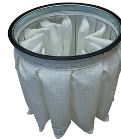
Conductive Star Shaped Filter with Cage for ORDLOC 652 - Included