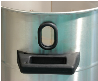
Sight Glass on Recovery Tank