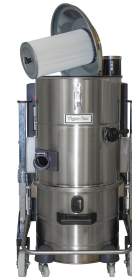
HEPA Filter - Included