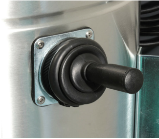
Side Mounted Manual Filter Shaker