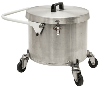
Extra recovery tank with lid to facilitate the refresh and re-use of the recovered powders (Part# 223001-ASM1) - Optional