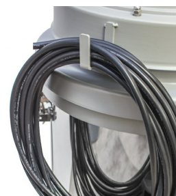
Cable Holder Hook included on the side of the powerhead