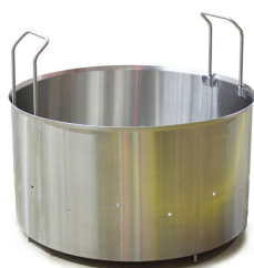
Sieve Basket - Included