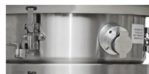
Degassing Vent - Included