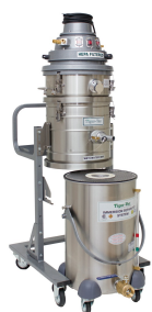
C-10EX (IT-63L) CFE SK HEPA with Recovery Tank removed