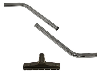
Optional 3D Tools