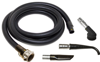
3D Tool Kit for 2" camlock suction inlet - included