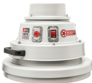
Longer Life Brushless Motor Available (always with 4 x H14 HEPA filters)