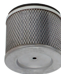
Coalescing HEPA filter (Upstream) - Included