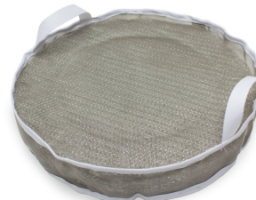
Mist Arrester Pack - Included