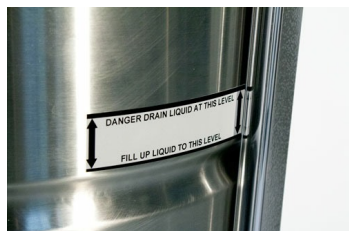
Liquid Level Indicator Tube - Included