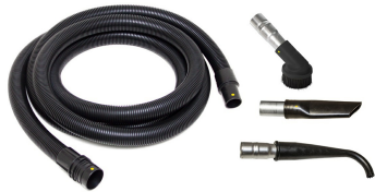
3D Tool Kit for 60 mm suction inlet - included