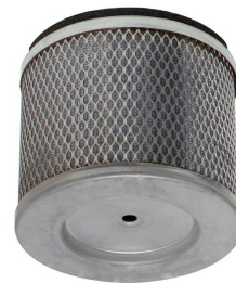
Coalescing Filter Element (CFE) - Included