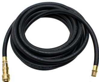
Air Supply Hose Assembly, Static Dissipative and Conductive - Included