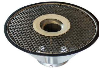
Cone for Interceptors - Included