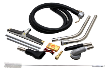
Tool Kit for Interceptors - Included