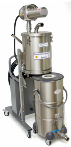
SS-IT (85L) EX (CFE) HEPA with Recovery Tank removed