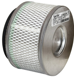
HEPA Filter - Included