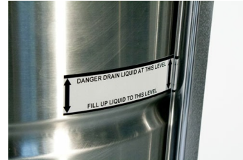
Liquid Level Indicator Tube - Included