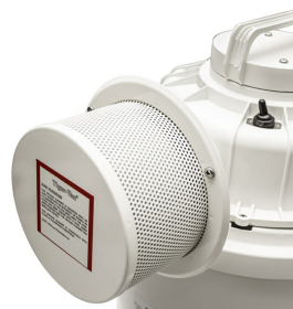
#214860 HEPA/ULPA Filter Protector/Housing Kit - Available