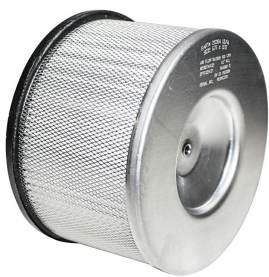
ULPA Filter for CR-1 ULPA - Included