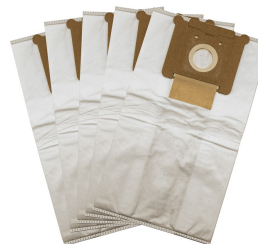
A package of 5 synthetic recovery bags is included (Part No. 212500)