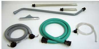
ARU STD Tools and Accessories - Included