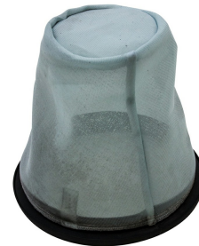
Liquid Filter - Included