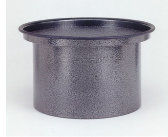
Activated Carbon Cartridge - Optional