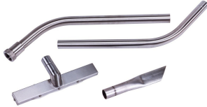
LARU Tools and Accessories - Included