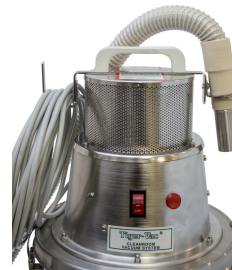
Stainless steel holding bracket - Optional