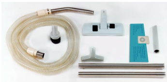
CR-4D Tools and Accessories with Disposable Filter Bag - Included