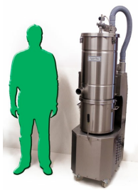
CD-2600 Next to average sized man