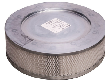
HEPA Filter - Optional