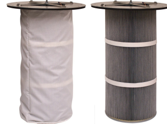
Conductive Aluminized Spun Bond Reverse Purge Cartridge (shown with and without optional skirt) - Included