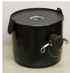
Safe containment canister - Included