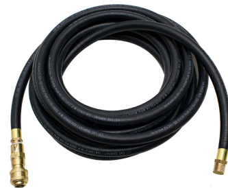
Air Supply Hose Assembly, Static Dissipative and Conductive - Included