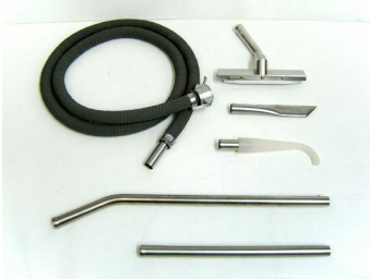
#323604 - Ø1.25" (Ø32 mm) Autoclavable tools and accessories (Kit #3) - Included