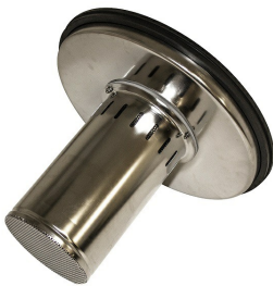
Stainless Steel Floater (Liquid Cut-Off) for Wet & Dry Version - Included