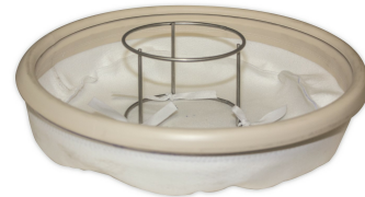
Conductive Main Cloth filter and Cage - Included