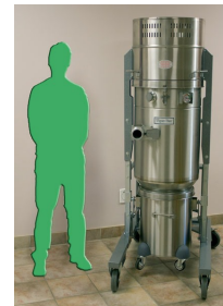
CD/EUR-50L EX DT next to an average sized man