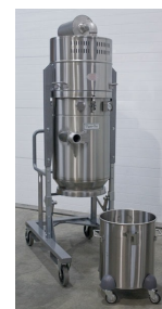
CD/EUR-50L EX DT with Recovery Tank removed