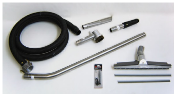
Ø2" (Ø50 mm) Static Dissipative Tools and Accessories - Optional