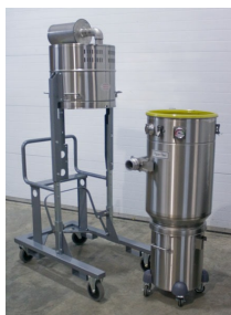
CD/EUR-50L EX DT with Recovery Tank and Filter Chamber removed