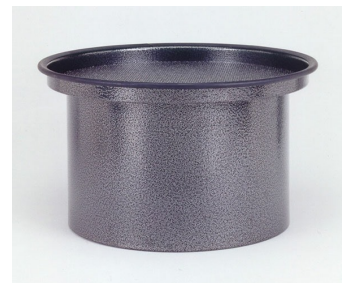
Activated Carbon Cartridge - Optional