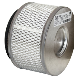
ULPA Filter - Included