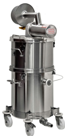
SS-10/15 CR (MRAC)