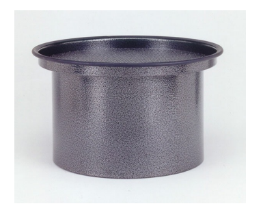
Activated Carbon Cartridge - Optional