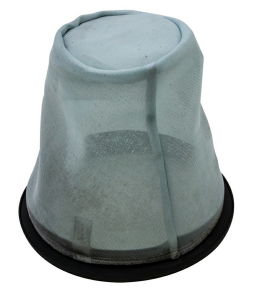
Liquid Filter - Included