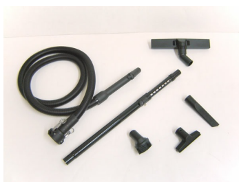
# 323600 - Ø1.25" (Ø32 mm) Standard Tools and Accessories (Kit # 323602 - Ø1.25" (Ø32 mm) ESD safe tools and accessories (Kit #1) - Optional