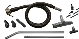
#2) - Optional