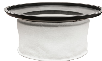
Main Cloth Filter - Included