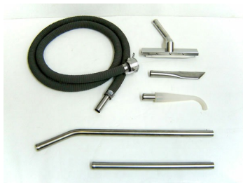
#323604 - Ø1.25" (Ø32 mm) Autoclavable tools and accessories (Kit #3) - Optional