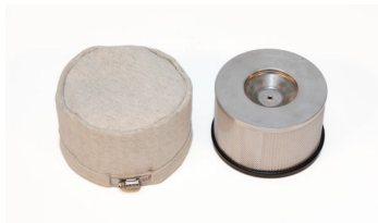
HEPA Filter with Safety Filter - Included