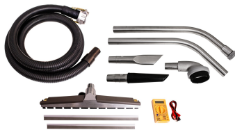
CD-120V/230V Tool Kit - Included