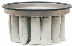
Filter Tubes Assembly for MRPFT models - Included