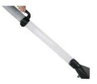
990326 - Bulk Pick-Up Wand for Dust Collector - optional