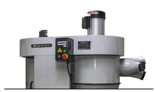
NO LONGER AVAILABLE