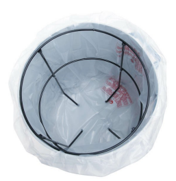
Megaton Inner Frame (Plastic Bag Holder) keeps the plastic Polyliner in place