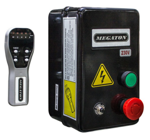
Megaton Remote Control - Included